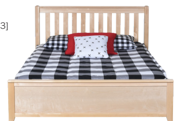
Queen Single Bed