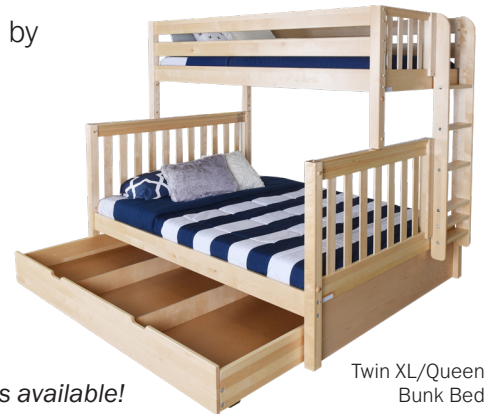
Twin XL/Queen Bunk Bed

Make extra space by adding length and depth to your Maxtrix® Bunk!