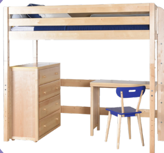
Queen High Loft